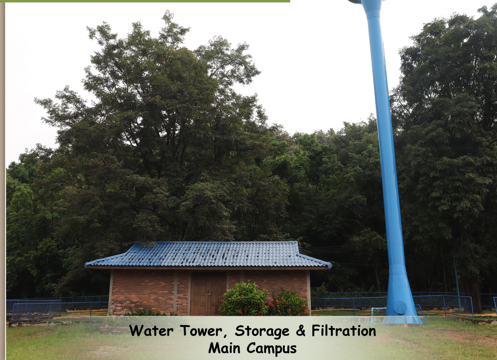
Water Tower, Storage & Filtration Main Campus

We want to put in a Water Tower, Storage & Filtration System at our new Youth Camp/Conference Center Property